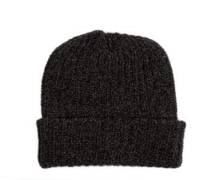
Woollen Hat especially in Winters