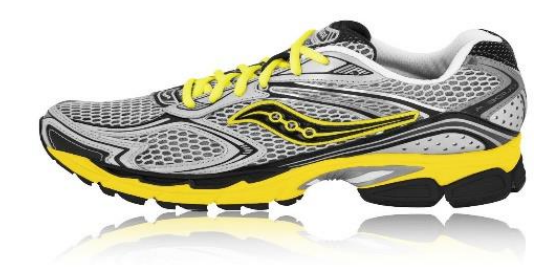
Trainers with socks