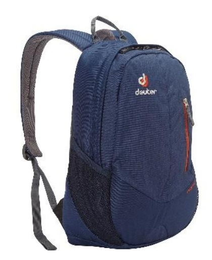
Day Pack( 20 -30 ltrs) Please do not carry any Suticases